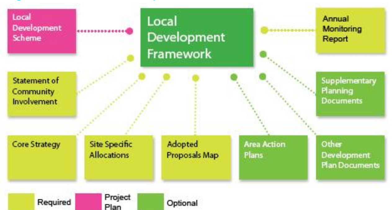
Figure 1: The Local Development Framework