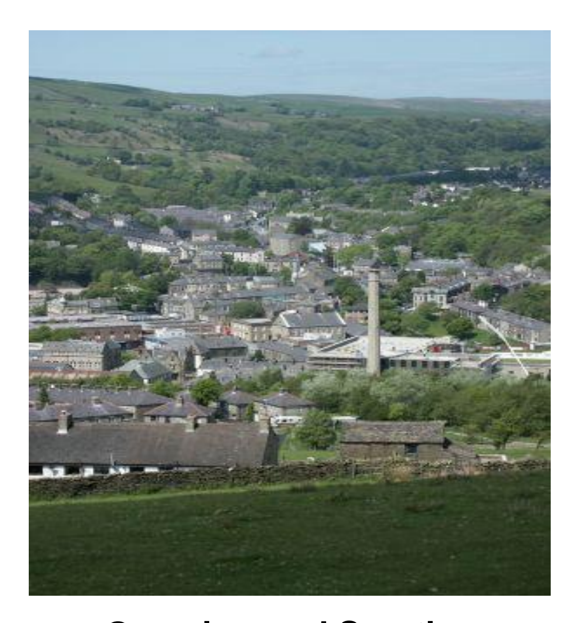
Overview and Scrutiny