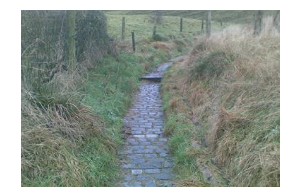
Footpaths in Rossendale

The questionnaire asked people to confirm if they would like to attend a meeting of the task and finish group and over 80 people indicated they would like to come along to give their views on the current footpaths around Rossendale.