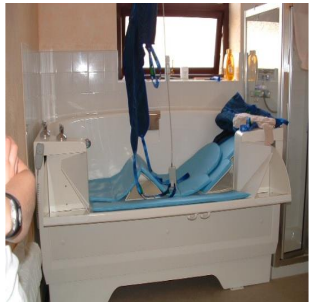
Height Adjustable Bath