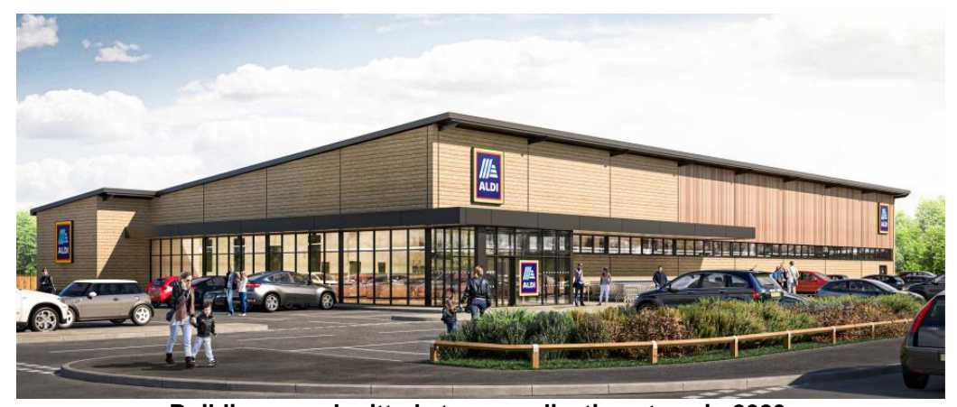
Building as submitted at pre-application stage in 2020.

During the pre-application discussions, and during the course of the application, the applicant has been willing to accommodate the recommended changes and further recommendations from consultees including ecology and landscaping, and has taken positive steps to make alterations to the design. Overall the scheme is now considered to be successful, fitting in well with its surroundings.