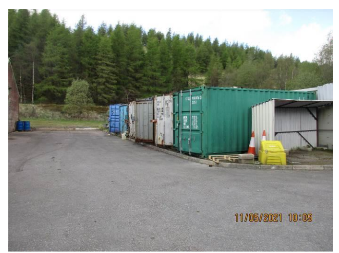
Container yard area.