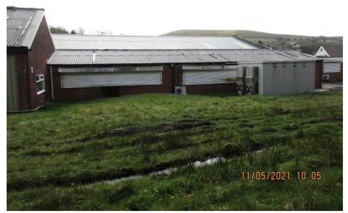
West facing elevation.