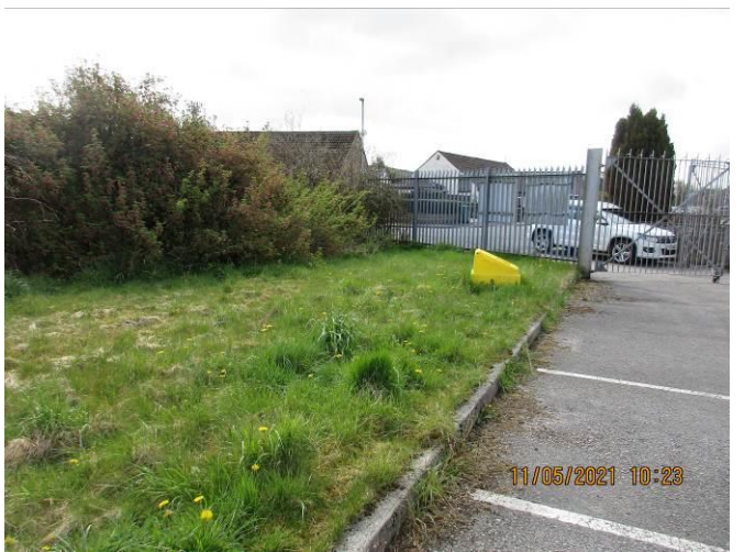
Car parking along east boundary and entrance.