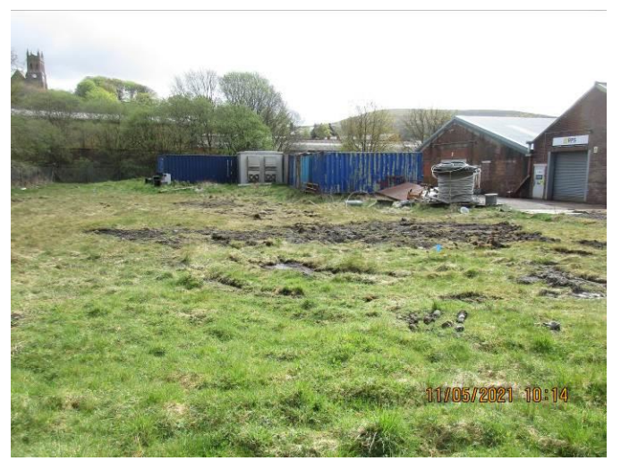
North west end of site.