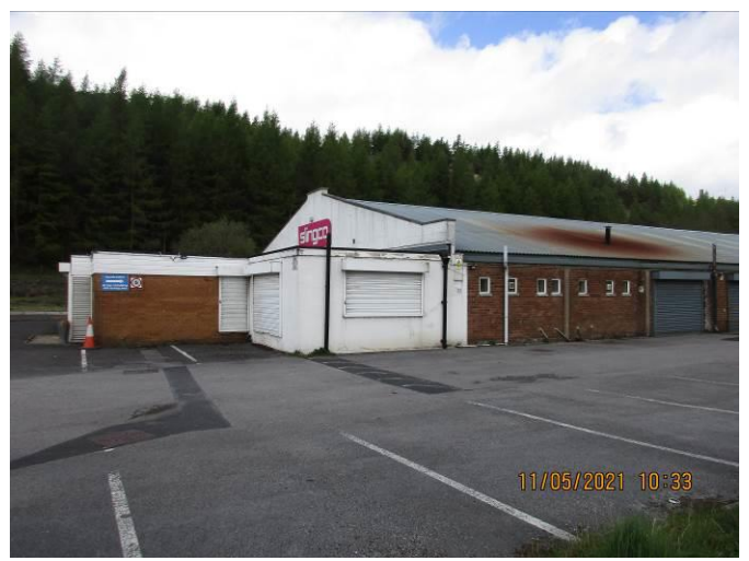
Front from east.