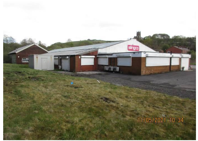
Front elevation from the west.