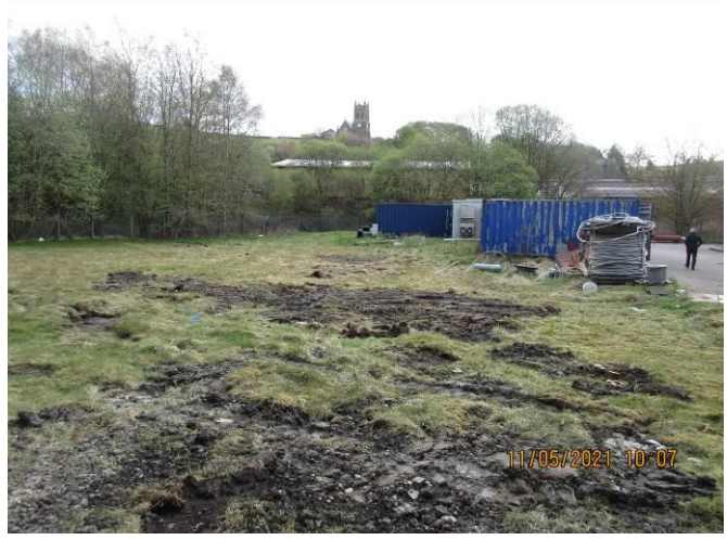
Recent ground investigation disturbance.