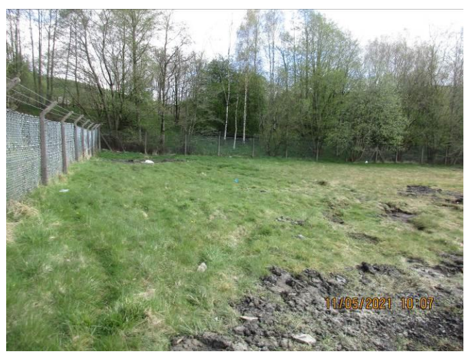
Undeveloped west area.