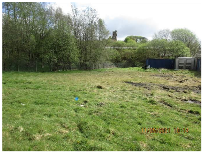
West side of site.