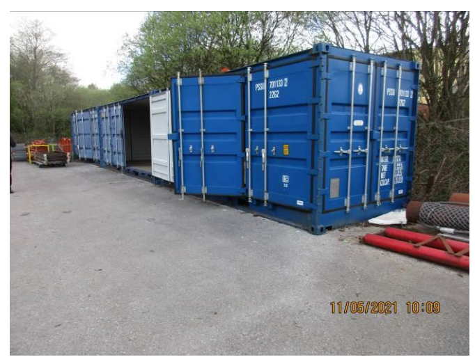
Container yard area.