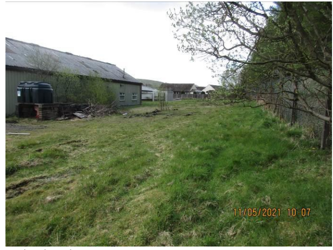
Undeveloped west area.