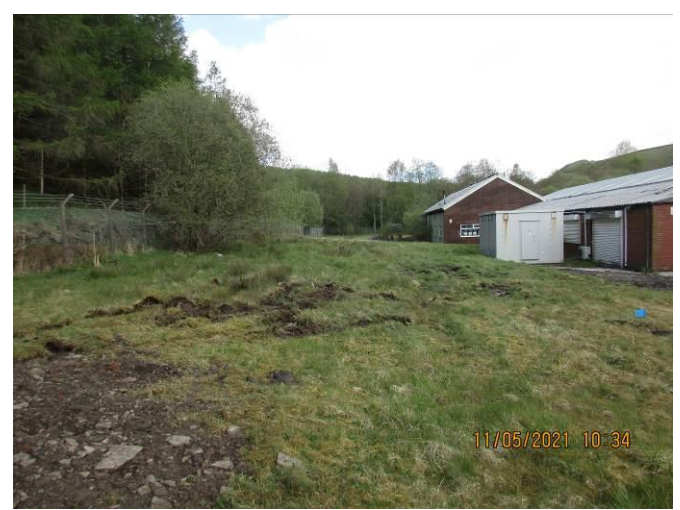
Rear undeveloped part of site.