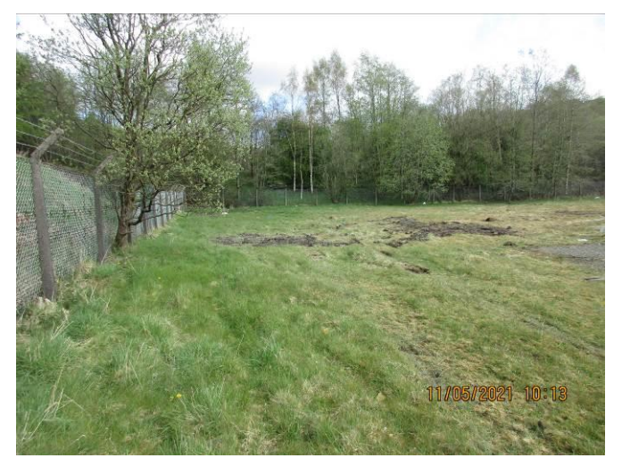
West side of site.