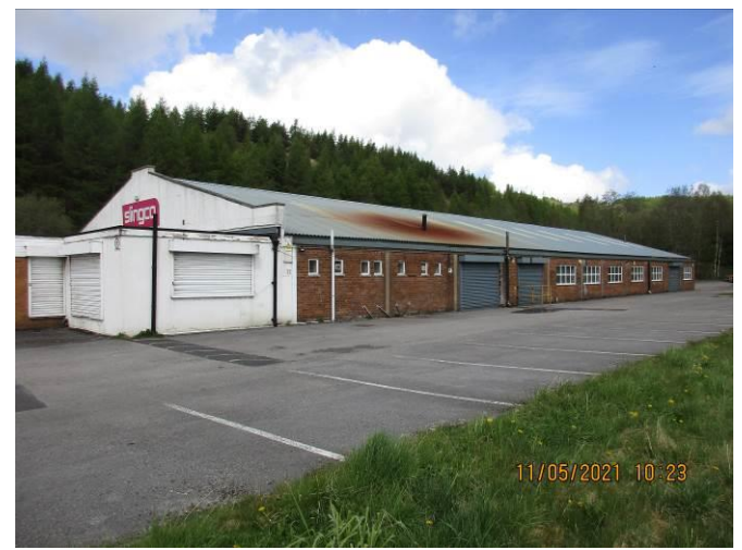
East facing elevation.