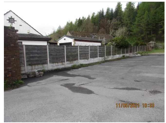
Car park to south end.