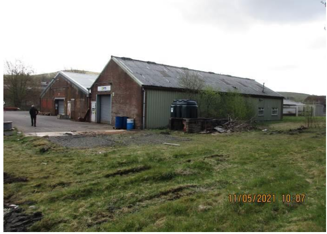
North west facing corner of buildings.