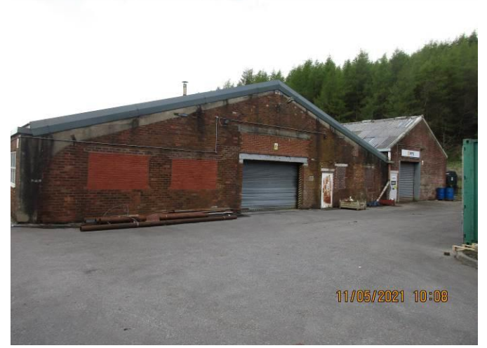
North facing elevation.