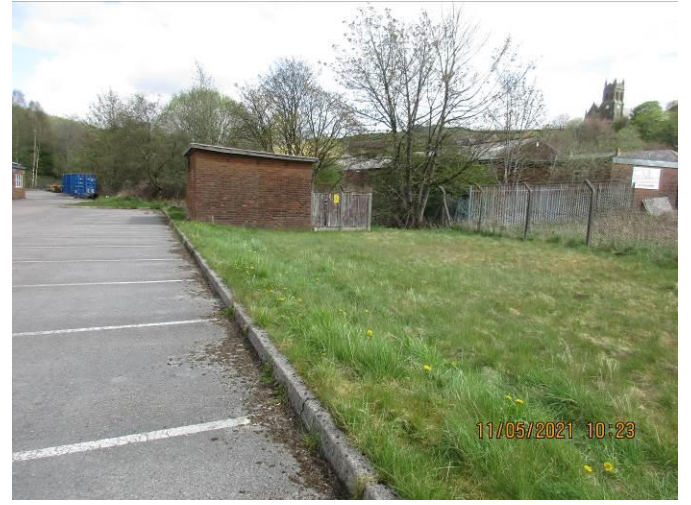
Car park alongside east boundary.