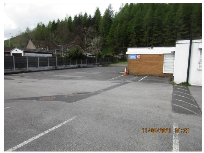
Front car park.