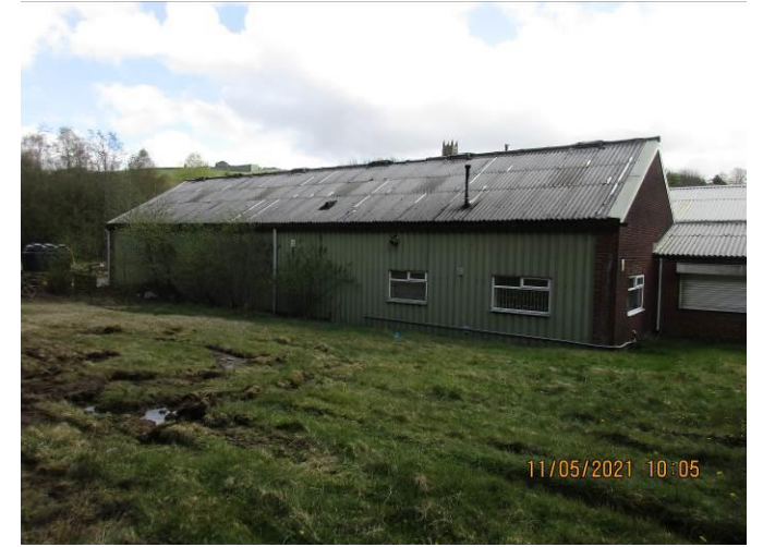
North west facing elevation.