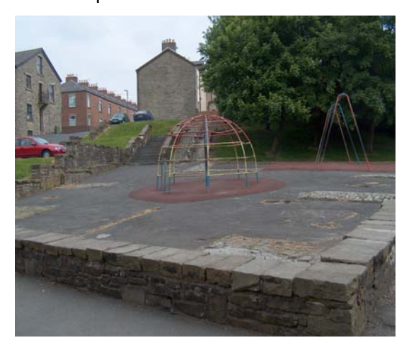
Run down and disused Laburnum Street play area, Haslingden

We aim to improve or remove areas like this: