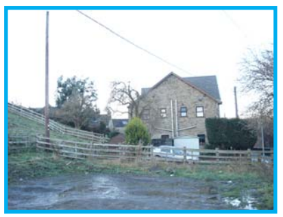
Figure 32: Riding School Car Park

immediately to the east of the buildings, and the riding school is to the west ( Fig 32 ).