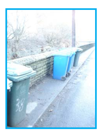
Figure 41: Lack of Storage for residents bins

9. The lack of storage for the resident's bins ( Fig.41 ).