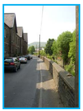
Figure 40: Difficulty in finding parking space for residents

8. Apparent difficulty in finding parking space for residents ( Fig.40 ).