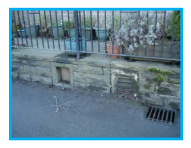
Figure 17: Stone Platform