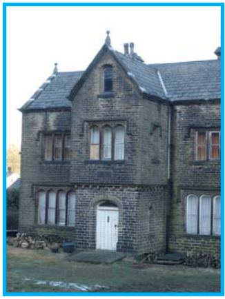
Figure 29: Cherry Tree House

Its steeply-pitched roof and full height gabled porch have stone copings and ball finials, and the multi-light stone mullioned windows, those to the ground floor with segmental arches to the lights, and all mouldings with hood moulds with label stops.