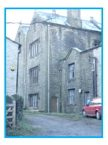
Figure 28: 3 to 5 Dam Top

historic interest. The inspector's report made at that time describes the buildings as follows: Cherry Tree House and numbers 3 to 5 Dam Top together make up a complex of mid 19<sup>th</sup> century buildings built in an austere Neovernacular style reflecting the 17<sup>th</sup> century building tradition in the locality.