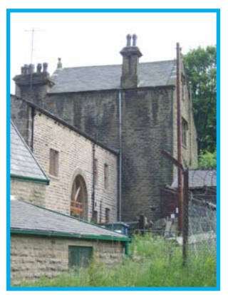
Figure 27: Fall Barn

The barn and number 1 are also built in watershot coursed stone with a slate roof containing rooflights and a new slender chimney stack.