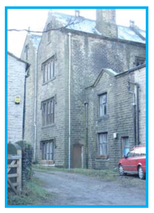
Figure 13: Cherry Tree House

However, it is Cherry Tree House which is the dominant force in the group ( Figs 13 and 14 ). It stands high above the barn, ranging from two to four storeys. It is built from pitched faced coursed stone with a steeply pitched slate roof. It is an austere copy of a 17th century mansion, built to a design common in the local area at that time.