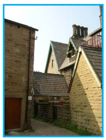
Figure 20: Rear of Merry Trees

The back of the terrace is the product of a higher quality of design than is normally the case with rear elevations. Again there are big lateral gables and tall roof pitches with strong tallish outshots at around level with double pitched roofs (Fig 20). Window openings are generally plainer. There is a modern timber dormer with French windows and a balustrade above the main eaves level, and an upper level conservatory at one end.