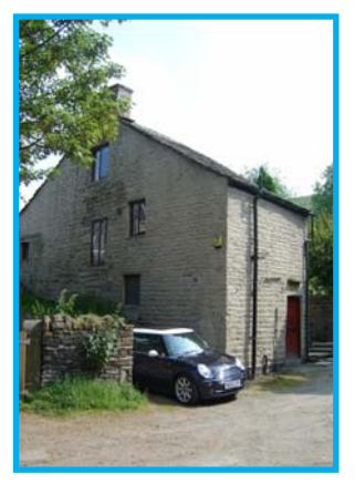
Figure 11: Rose Cottage

The barn appears to be c1800 and possibly altered at the building of Cherry Tree House. It is a good plain building constructed in coursed stone with a slate roof. The stonework and coursing is good quality with two arched barn doors and strong cornerstones. The stone bonding at the meeting with 3 & 5 Dam Top shows the evidence of once being attached to a different building. The mullioned window at the rear is common in detail to others from c1800 in the local area. Looking up the track to the left is a small stone house (Rose Cottage) (Fig 11) built into raised ground and which, from parts of its walling, suggests a similar date to the barn. Below this is a spring and water trough (Fig 12) set in a stone wall and arch. The stonework on this is contemporary with the barn. Around are details such as