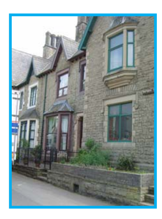
Figure 15: Merry Trees

Merry Trees is a terrace of two and three storeys built in coursed pitched faced stone with a steeply sloping decorated slate roof ( Figs 15 and 16 ). The terrace stands on a stone platform raised above road level and topped by large stone flags ( Fig 17 ).