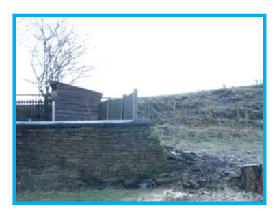
Figure 38: Poor condition of boundary wall

7. The impact of street lighting and BT poles on the appearance of the street (Fig.39) .