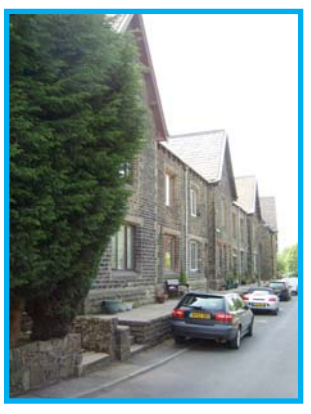
Figure 21: Albert Terrace

(incorporating 57 to 69 Fall Barn Road) ( Fig 21 ) is a two and three storey high stone terrace built in a robust and substantial style and longer than Merry Trees, having an additional central lateral bay and gable.