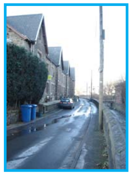
Figure 39: Impact of street lighting

8. Apparent difficulty in finding parking space for residents ( Fig.40 ).