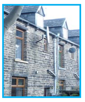
Figure 9: Albert Terrace

The area is a very tight group of buildings centred at the meeting of Fallbarn Road and the track leading down from Cherry Tree House. Merry Trees and Albert Terrace form the main public view of the group standing tall each side of the entrance track and facing the River Irwell in its stone walled cutting. Both are 2/3 storey bold Victorian properties built in roughly faced stone with tall and decorated slate covered roofs. Each has a stone plinth and railings to set them above road level. Merry Trees is finer in detail and decoration than Albert Terrace but the latter is much deeper in its footprint and is visually strong (Fig 9). Merry Trees has good stone detailing around windows and doors, tall chimneys, and has the remains of ornamental gothic window frames.