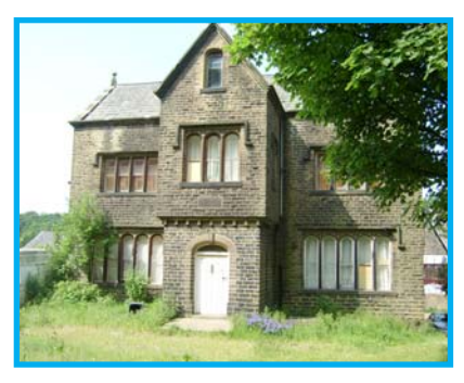
Figure 14: Cherry Tree House Front Elevation

stone detailing is from the 17<sup>th</sup> century; including hood mouldings, stone window tracery, arches and lintels, cornices and verges; but being from the mid 19<sup>th</sup> century it is still sharp and not eroded. The Dam Top cottages provide the building bridge between the height of Cherry Tree House and the two storey Fall Barn.