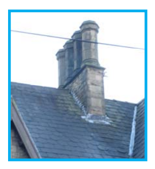
Figure 19: Chimney pots on Merry Trees

There are single, 4 pot (Fig 19), and double, 8 pot, chimney stacks in dressed stone with coursed moulded stone pots and drip moulds. Timber barge boards remain but some original window styles have been altered to much plainer and simpler replacements, which have an odd and unfortunate appearance. This is the main alteration from the original design. None are currently in uPVC. The quality of the stone detailing is maintained on the gable elevations.