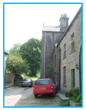
Figure 4: Cherry Tree House & Fall Barn

Figure 3: River and River Walls narrowness of Fallbarn Road reinforces the height and scale of Merry Trees and Albert Terrace. Set closely behind Fallbarn Road are Cherry Tree House, 3-5 Dam Top and Rose Cottage.