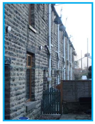
Figure 24: Rear of Albert Terrace

Although Albert Terrace is less ornate than Merry Trees it has significant presence in the street.