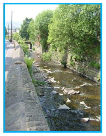
Figure 3: River and River Walls narrowness of Fallbarn Road reinforces the height and scale of Merry Trees and Albert Terrace. Set closely behind Fallbarn Road are Cherry Tree House, 3-5 Dam Top and Rose Cottage.

Views of the group are fairly open from the riverside and there are also glimpses from Rawtenstall and up and down the valley. The two terraces form a gateway to the inner/upper part of the group. The bridge across the river runs close to this entrance. The river and the river wall ( Fig 3 ) are an important part of the setting of the buildings, and the