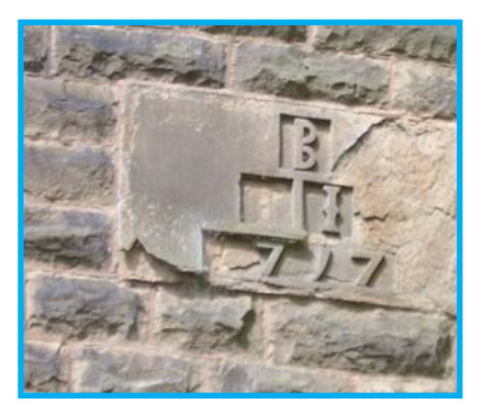
Figure 6: Date stone on Cherry Tree House

difficult ground, in this case a form of quicksand, which had previously made many parts of the valley bottom impossible to use. He had a particular and significant impact on the town and is important to the story of Rossendale.