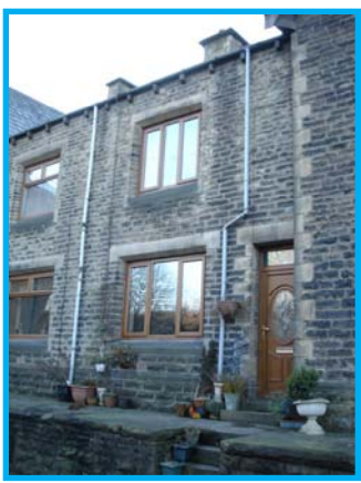
Figure 36: Examples of Window Alteration

4. The nature of some detailed alterations and changes to all occupied properties that have removed original features or used out of character replacements. The most severe of these is the result of window alteration ( Fig.36 ).