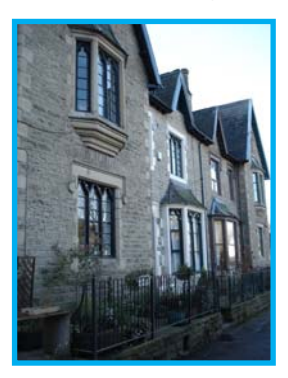
Figure 18: Numbers 53 and 55 Merry Trees

There are dressed stone details at openings and corners with splayed edges and reveals. Openings have stone decoration and hood moulds with plain shield labels. There are splendid bay and oriel windows with canopies in slate and lead. The bay windows have rough stone arches visible. Numbers 53 and 55 ( Fig 18 ) have largely retained the fine window frames, which have deep mouldings and triple