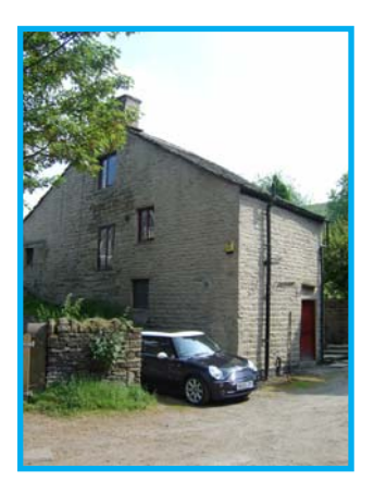
Figure 25: Rose Cottage

The building is set into the hillside. It is a slightly odd shape in being deep at rightangles to the roof ridge, and therefore with large gables. The gables have plain cement roof verges and there are simple small windows, though they are set in an unusual pattern. All this suggests that Rose Cottage was, some time ago, a different shape or part of a larger structure.