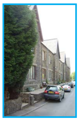
Figure 7: Back to back housing on Fallbarn Road

1717 (Fig 6) , which may have been from the farmhouse (or possibly a copy of the original date stone) it may have replaced.