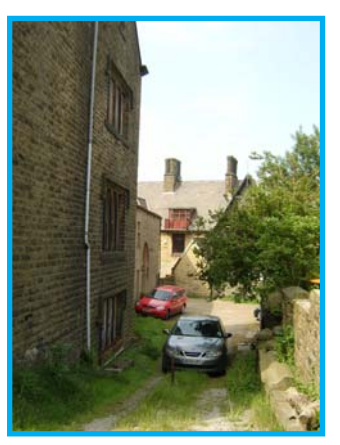
Figure 30: Numbers 3 and 5 Dam Top

of two storeys with attics, together with a lower range of two storeys. This robustlydetailed building is a good example of its type. This example is a competent but not exceptional design. The building is clearly an important component of its locality, and of local historic interest.