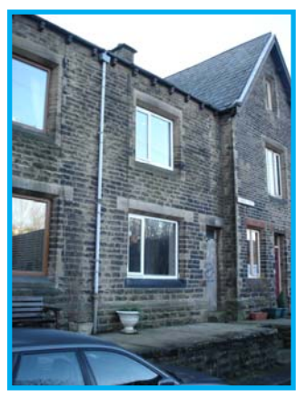
Figure 23: Window frames and doors in Albert Terrace

and this arrangement is clearly shown on the gables. The front elevation has plainer windows and simpler stone surrounds. Window openings in the gables are smaller.