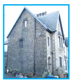
Figure 16: Merry Trees

platform. The railings on part of the platform may not be original. The three storey elements project at each end on the front elevation and have tall lateral gables and top floor windows.