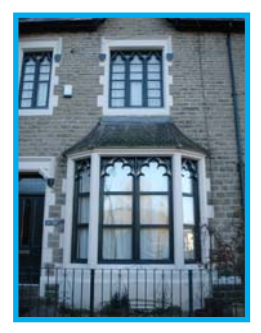
Figure 33: Window Frame Detail

7. The various stone walls, flag hardstandings, copings, gateposts and stone features are important to the detailed character of the area ( Fig. 34 ).