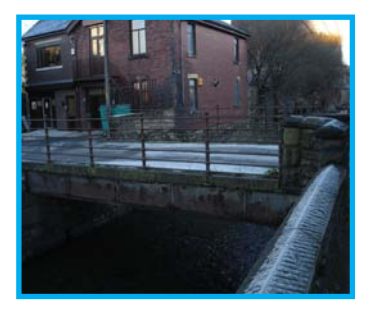
Figure 37: Pedestrian Bridge

5. The poor appearance of the pedestrian bridge over the river (Fig. 37) .