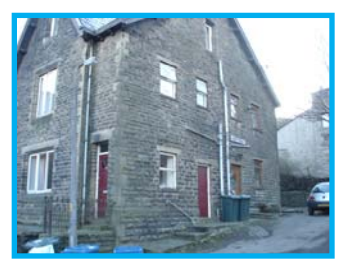
Figure 22: Albert Terrace Gable

in a much plainer and utilitarian style than Merry Trees. This suggests a later copy by a different designer. It has much of the form and scale of its neighbour though has greater depth ( Fig 22 ), giving space for true back-toback accommodation,