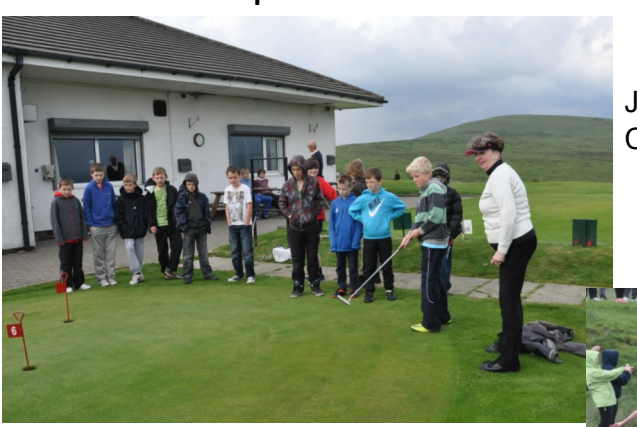
Junior Golf at Lobden Golf Club