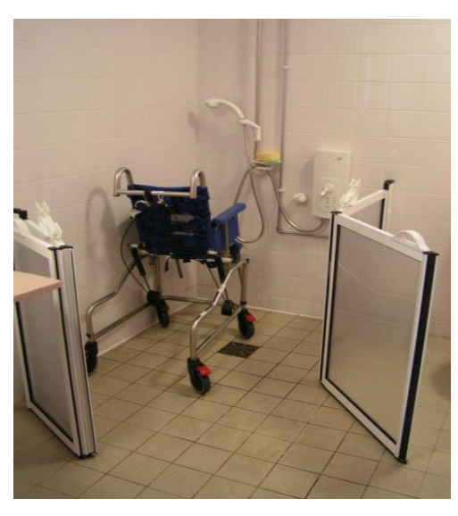
Level Access Shower

Disabled Facilities Grants (DFGs) are mandatory grants for essential adaptations to give disabled people better freedom of movement into and around their homes and to give access to essential facilities within the home.