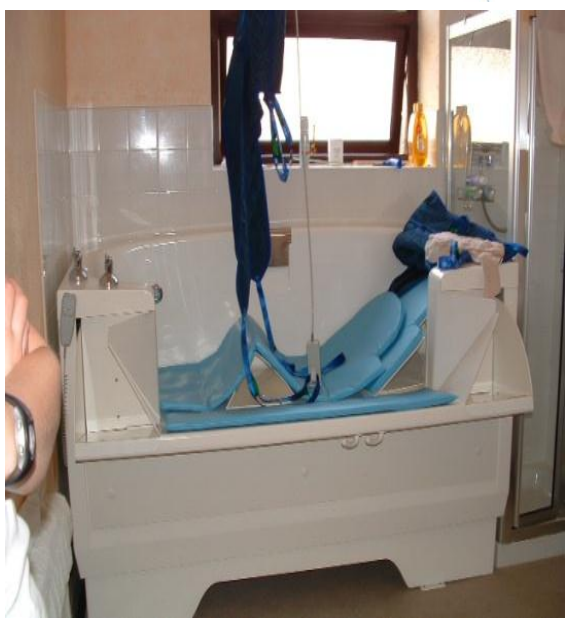
Height Adjustable Bath

3. Social Services will liaise with the Therapist Occupational or other appropriate professionals who will contact you to arrange to carry out an assessment to determine what equipment, adaptations or alterations are necessary and appropriate. This may also apply to adapting a home to improve the ability of the carer to look after the disabled person. If a person's needs can be met by the provision of equipment then no recommendation for a grant will be made. All minor adaptations under £500 are not referred to the Council, but are dealt with by Lancashire County Council Social Services