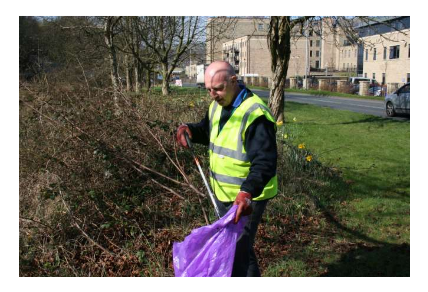
Section 1 – Statement of Accounts

This DRAFT Statement of Accounts 2014/15 will now be submitted for public inspection and external audit. The resulting audit report will appear on these pages when the final accounts are presented to the Audit & Accounts Committee in September 2015.