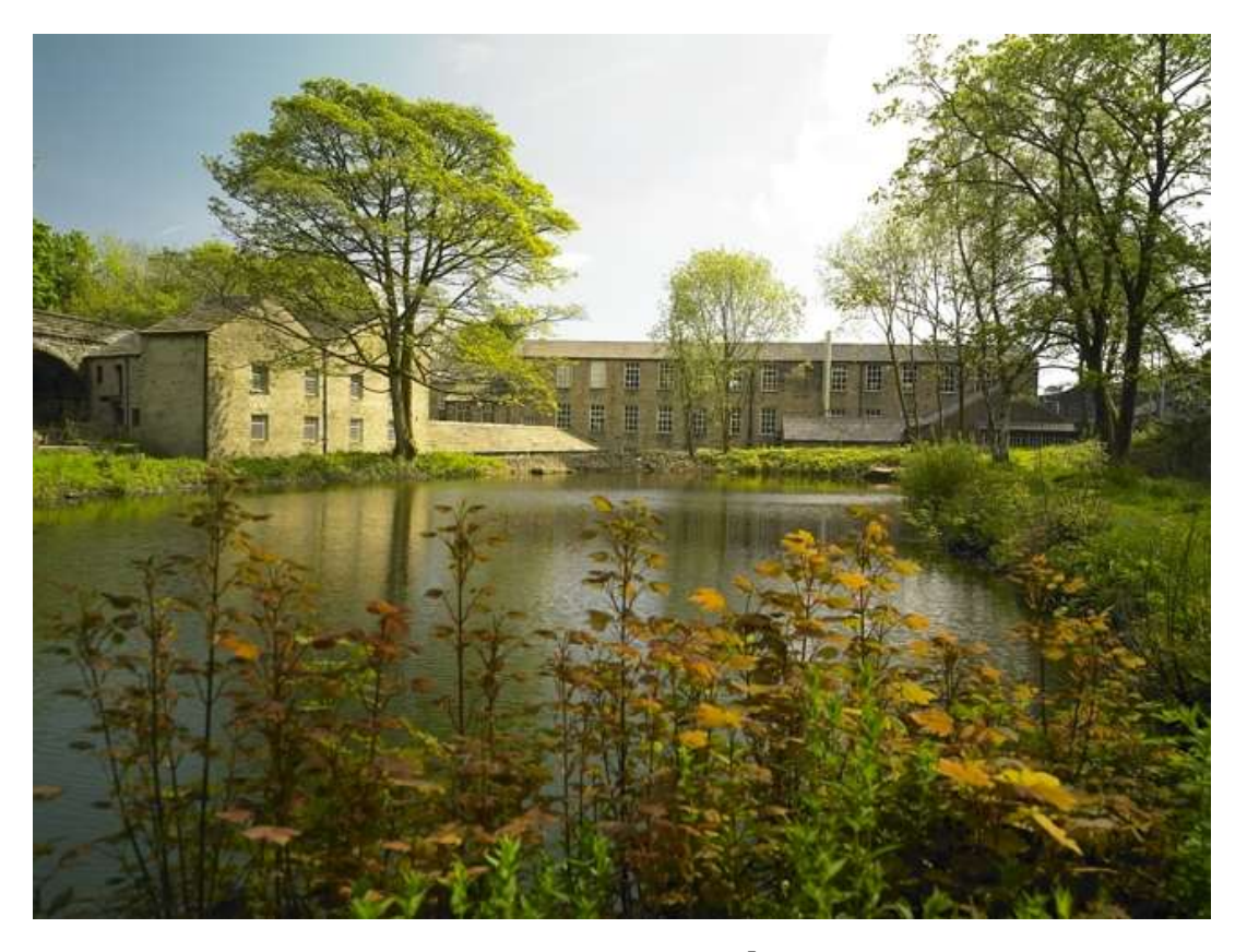
Section 2 - Core Statements & Notes

Following completion in October 2012, the investment in dry sports facilities at Marl Pits is being operated by Rossendale Leisure Trust and the annual borrowing costs of the above loan are partly matched against savings in the support grant payable to the Trust. Until the facility was operational, interest payments and receipts were capitalised. In 2012/2013 the capitalised cost of this borrowing was £110k. At the same time the capitalised interest earned on the balance of the loan was £8k. There have been no capitalised payments or receipts in 2013/2014 – see Note 24.