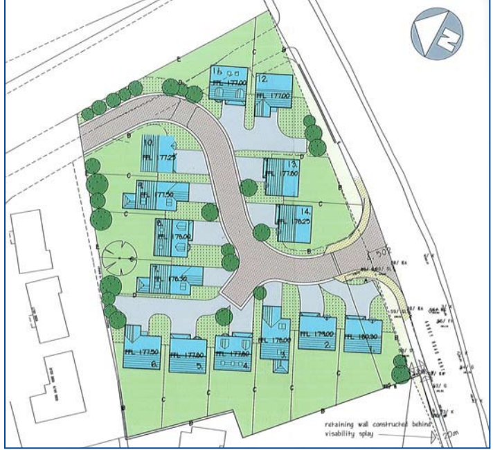
Masterplan submitted with planning application (2007/91451)