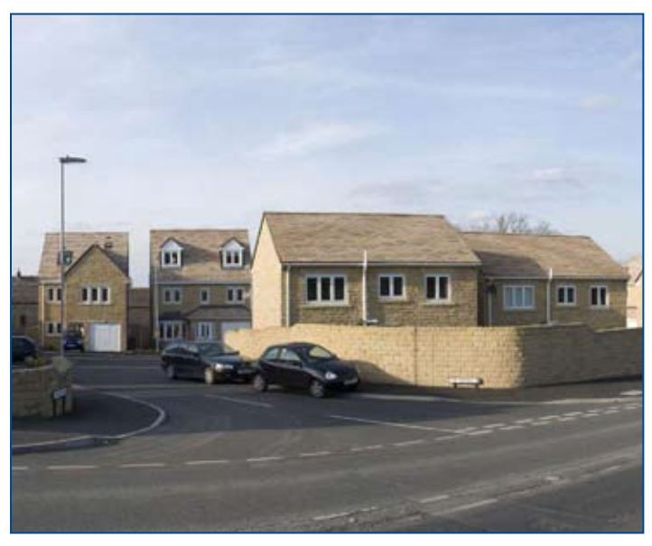
View of the development

Kirklees Unitary Development Plan. The development has helped to define and strengthen the character and residential edge of Shepley.