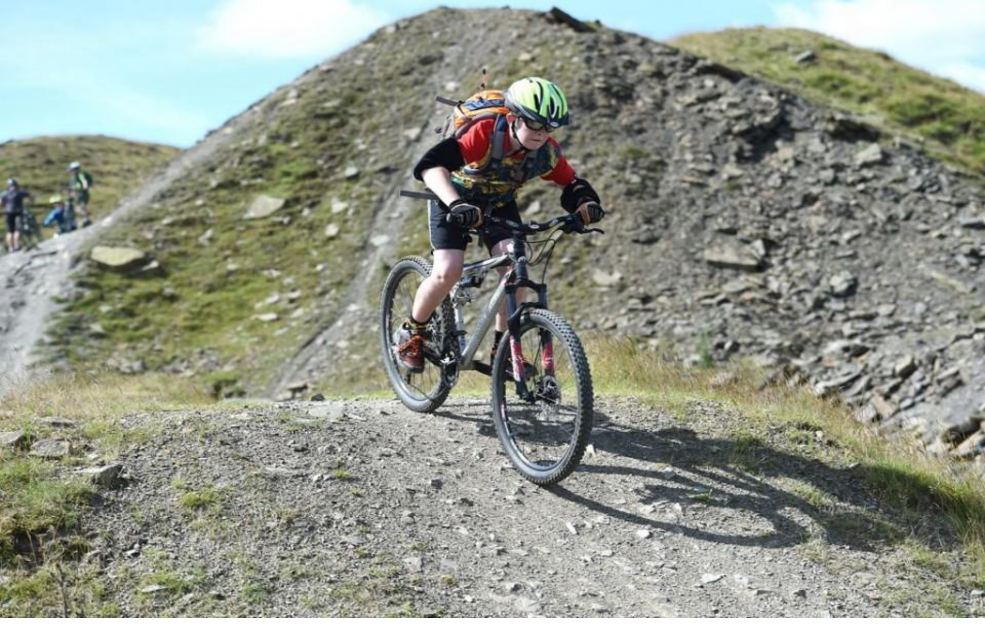
July The Midweek MTB Madness 2017 Race 5 takes over Lee Quarry, Bacup