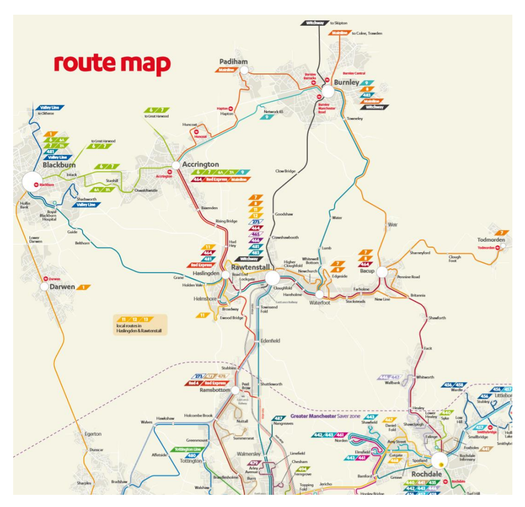
Figure 1 Rossendale Bus Route map. Source: Russo Bus.<sup>5</sup>

The approach to promote the use of public transport is consistent with Strategic Policy TR1, which supports the promotion of sustainable transport solution to address both congestion and air pollution. As part of this strategy, a Park and Ride site is earmarked for protection at Ewood Bridge (shown on the Policies Map).