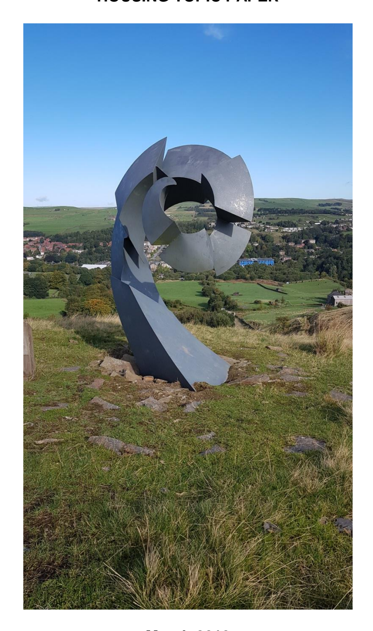
Rossendale Borough council