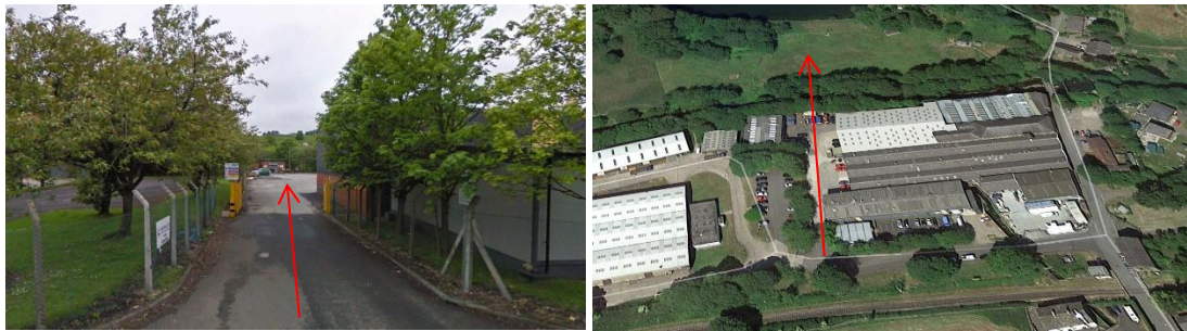
Figure 2.2 Existing Access Road and potential point of access.