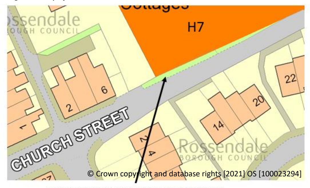
Figure B: Strip of land outside site allocation H7

The strip of land identified at the Hearing Session as a potential constraint to accessing the site.