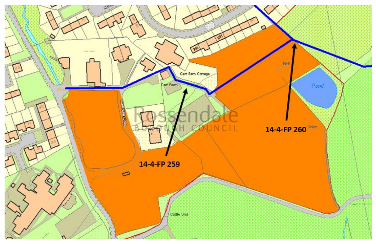
Figure C: PROWs within site allocation H18