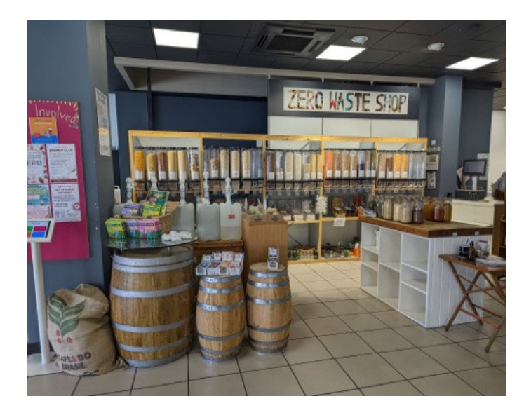
Climate change and sustainability centre