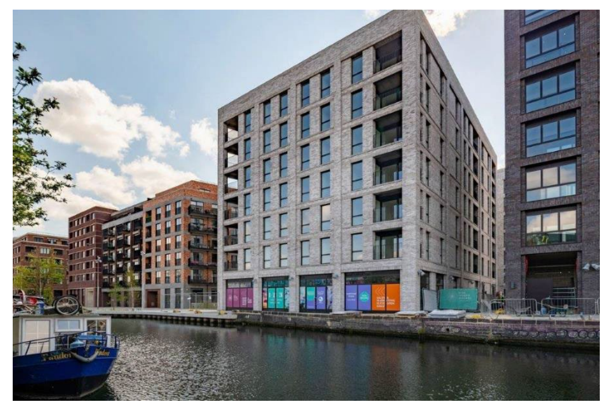
Image: <u>The Construction Image</u> showing ground floor commercial space in a new housing development